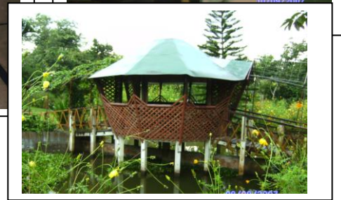
The Missionary Benedictine sisters of Manila - a meditation room on "ecology farm" (above and right) and working in the slums (left).