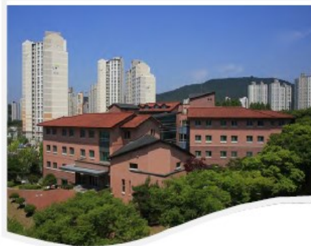
ST. BENEDICT SPIRITUALITY CENTER