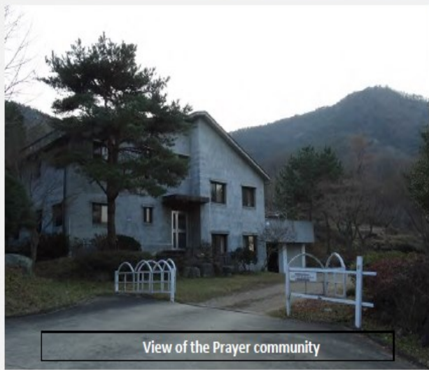
View of the Prayer community