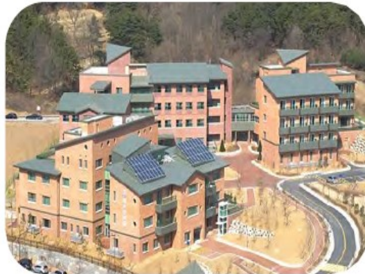
SCHOLASTICA HOUSE, HAESUNG(MARIESTELLA)

KINDERGARTEN, FATIMA HOME, BENEDICT EDUCATION CENTER