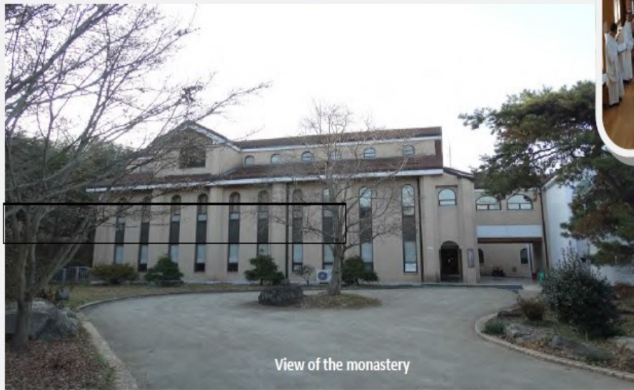
View of the monastery