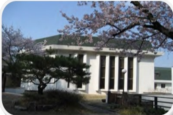
Seoul Benedict Kindergarten http://cafe.naver.com/benedictine

MISSIONARY BENEDICTINE SISTERS OF TUTZING SEOUL PRIORY September 17-19