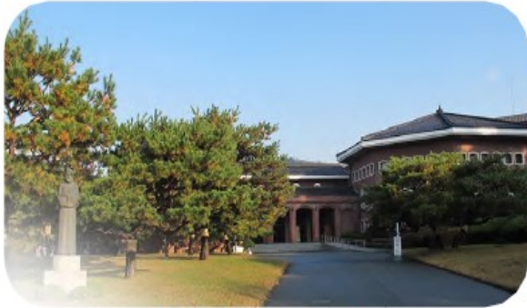
DAEGU PRIORY HOUSE