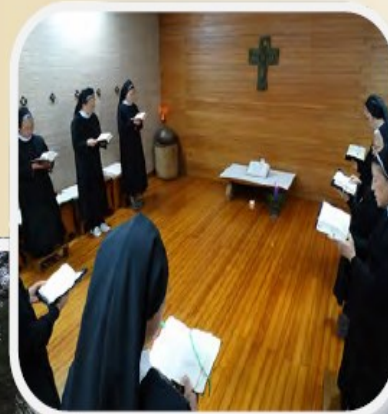
P R A Y E R