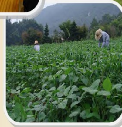
L A B O R