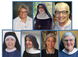
CIB Ad Team pp 4 - 5