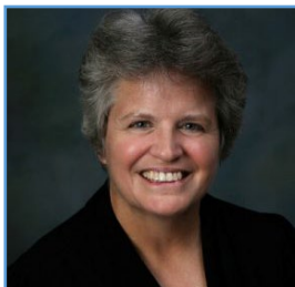
From the desk of Sr. Lynn McKenzie, CIB Moderator pp 1 - 3