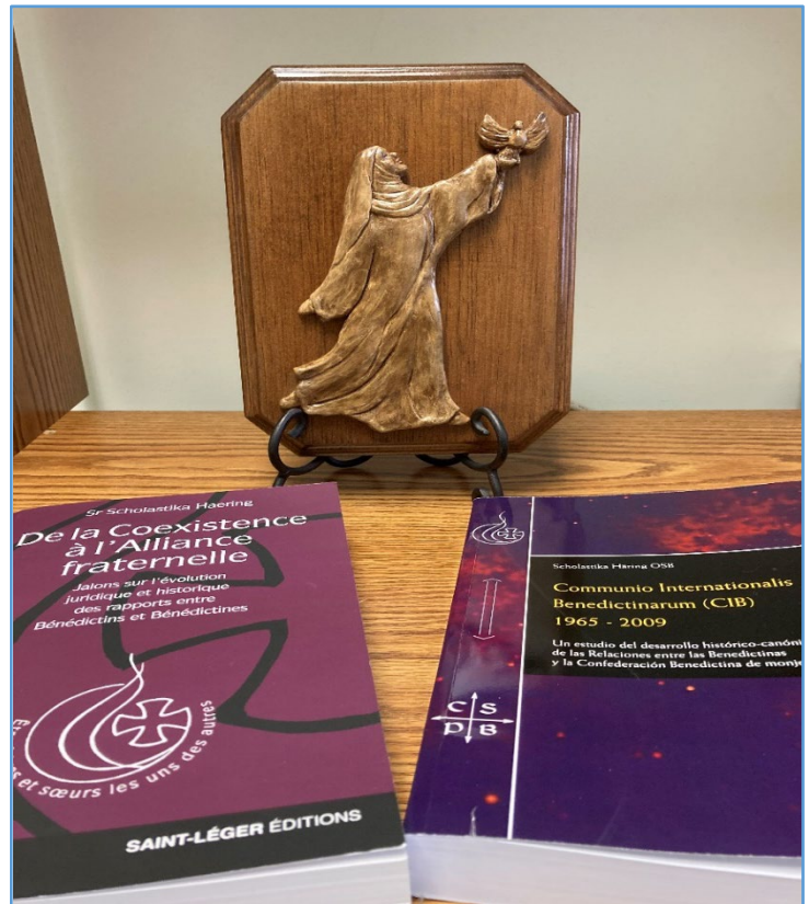
These two languages of French and Spanish account for the languages of many countries and many monasteries in various parts of the world.