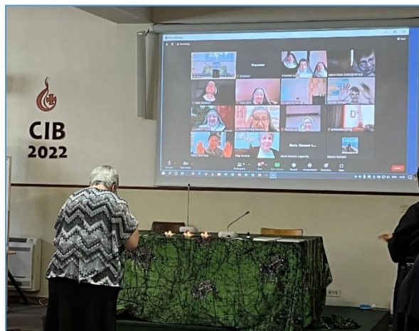
Newly re-elected Moderator receiving blessing from online participants of 2022 CIB Conference of Delegates