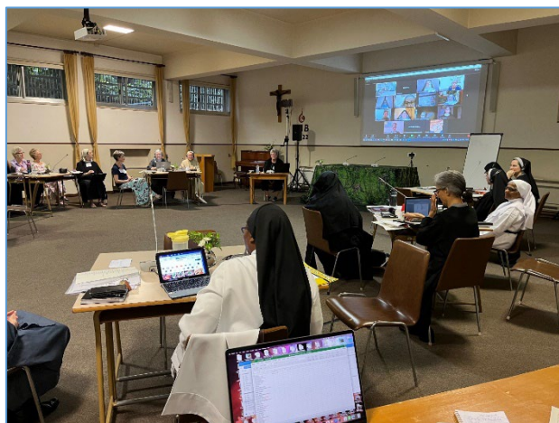
Meeting room at Casa Spirito Santo