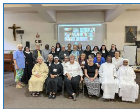
Reflections of the 2022 CIB Conference of Delegates p 6